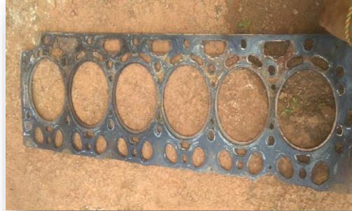
Corrosive Engine Head Gasket

Then,we dismantled the engine head . Then, we checked head and head gasket.Engine head gasket was not good.So, we changed new head gasket and we mounted engine head.Then, we test run the machine about 4 hrs.Engine is not overheat or not hot .It was ok.